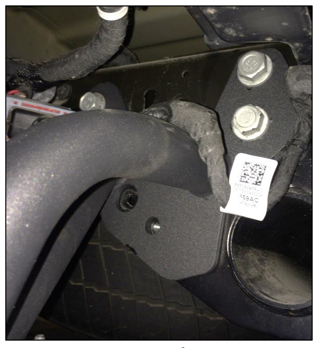
Page 1 of 1

Install the bumper step by lining up the holes of the bumper step with the holes in the truck. Then reinstall the factory bolts that were removed in step one. Ensure that the wiring is not in the way and Fully tighten the hardware.